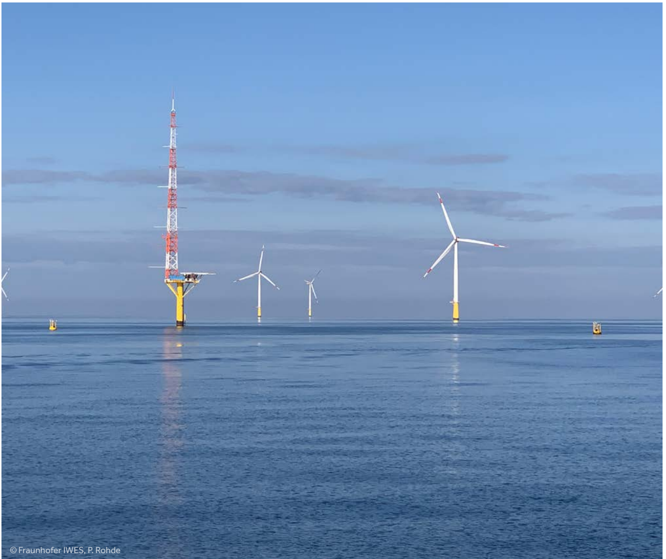
Two Fraunhofer IWES wind lidar buoys during performance verification next to the FINO3 offshore met. mast in the German Bight

The same applies to national authorities which are entrusted with the awarding of offshore sites and the coordinated planning of wind farm projects. These include the Netherlands Enterprise Agency (RVO) and the German Federal Maritime and Hydrographic Agency (BSH), for which FLS has been an integral part of its tenders for wind measurement services for several years now.