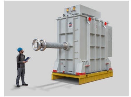
Test reactor 225 kV Reactor data: Rated voltage: 225 kV Rated current: 122 A

The testing of cable segments for the Xlink project presents a myriad of challenges, ranging from technical limitations to design considerations. However, scientific solutions abound, offering avenues for overcoming these challenges and ensuring the operational