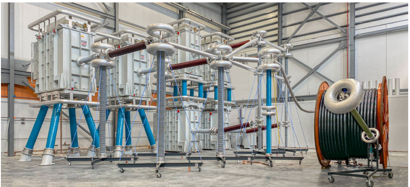
Resonant test system for very long cables