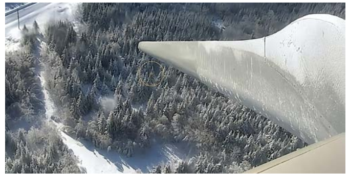
A blade from the same turbine which is free of ice build-up.

would be at 0%. At wind farm #2 the percentage increase was 40% for year 1, 29% for year 2 and 12% for year 3, with the assumption that year 4 would be at 0%. That customer is going to be doing a 4 year recoat program because the winter production more than pays for the maintenance program.