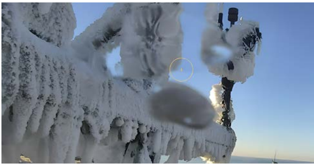
A nacelle surface without NEINICE coating covered in a thick layer of ice. These photos were taken on the same day.