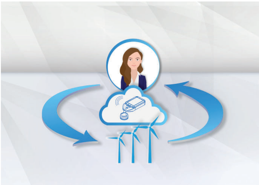
Active Asset Management: closing the loop between asset managers and their assets

Instant access from anywhere, simultaneous work, sharing knowledge and experience, improving for the whole community no matter the location.