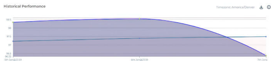
Figure 1: SUNOPS Historical Performance view reveals declining availability

Using SUNOPS to troubleshoot a drop in tracker performance, the plant experienced the following outcomes. Repair work completed in just five days. Tracker availability reached 99%+ in the days following the repairs. The plant recovered up to 12 MWh/day of energy that would otherwise have been lost due to tracker underperformance* and $11,400/month in revenue**.