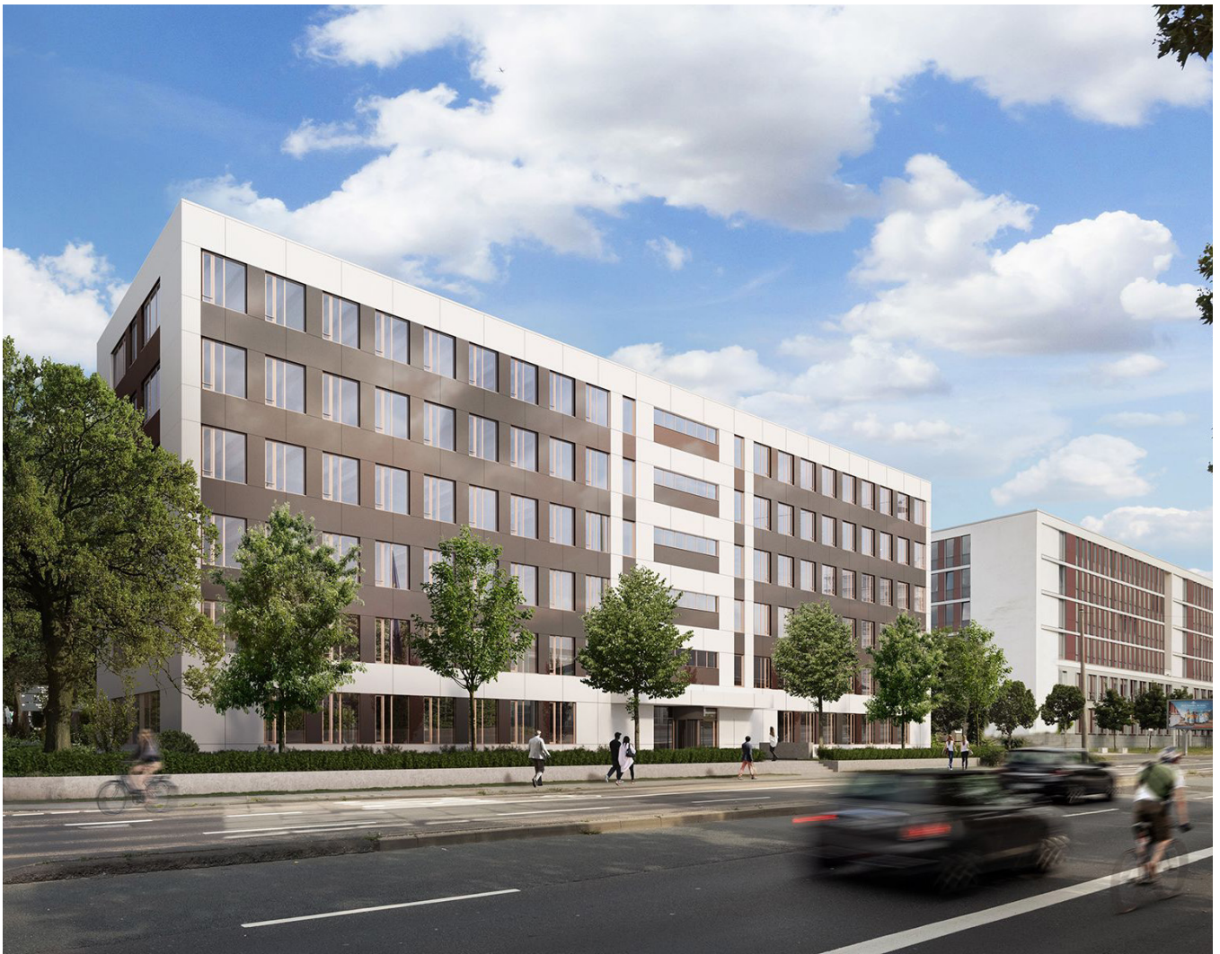
Rendering of installation from Sunovation

SB: Clearly yes. Although we have inquiries for all colors we offer, architects are frequently asking for grey. Especially the 'different shades of grey' we can achieve with our RGB coloring. This helps to give architects the freedom of design needed to implement solar modules into the facades of the future. Red and terracotta are also hot colors for rooftop integration.