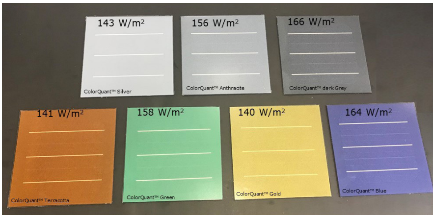
Examples of one cell solar modules with colors achievable by ColorQuant™. Uncolored reference module had 175 W/m 2

on a white background. As a solar cell is always very dark, at least if the efficiency is high, we work with a RGB system like the human eye. This is shown in graph 1.