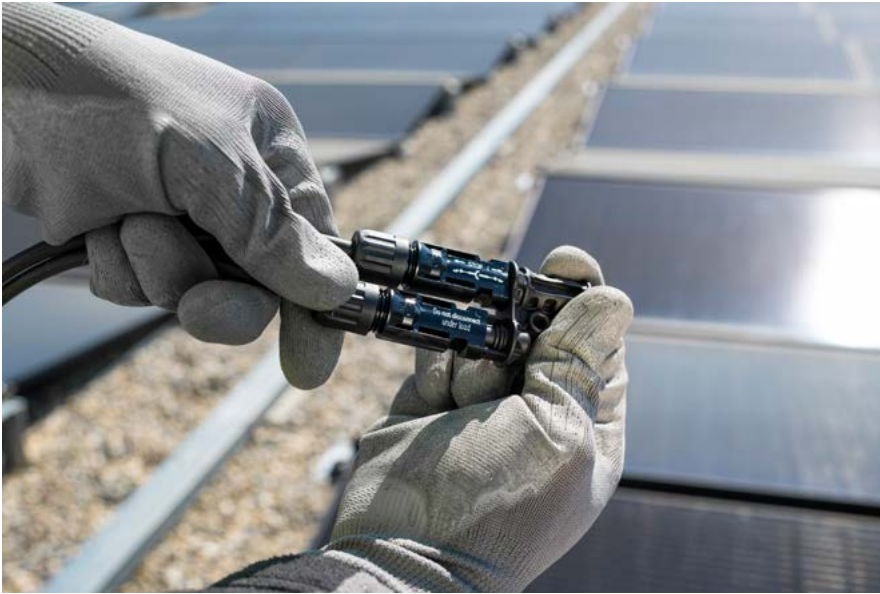
The MC4-Evo 2 branch connector

of hectares. These installations consist of hundreds of thousands of PV modules that need to be connected to the system. The eBOS components collect the outputs from all the solar panels and combine them to match the electrical input parameters of the inverter.