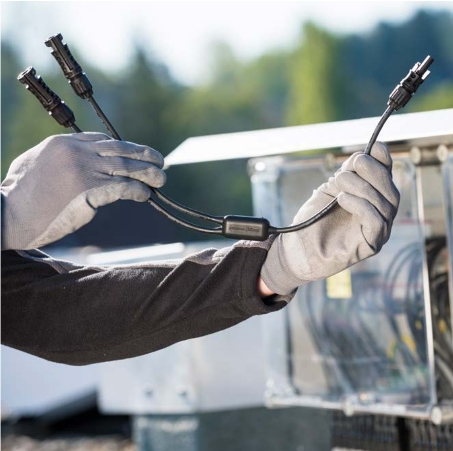
The Stäubli MC4-Evo 2 Y-Splitter

application errors. The Stäubli product solutions have a proven track record and are known for their reliability.