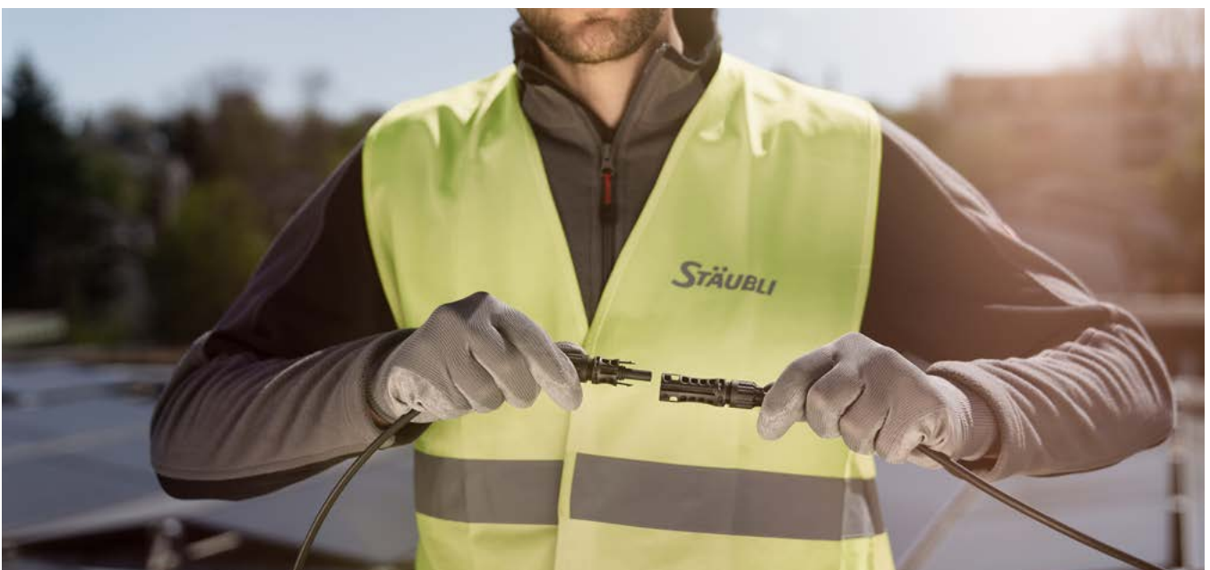
The Stäubli PV connectors with low contact resistance, correct assembly and installation can help to mitigate risks and improve the reliability of PV systems

AV: Ultimately, what every customer wants is a quality solution that can live up to its promised lifetime and guarantee the return of investment. Coming back to the mentioned international studies based on field data, we learn that more than two thirds of issues are related to eBOS