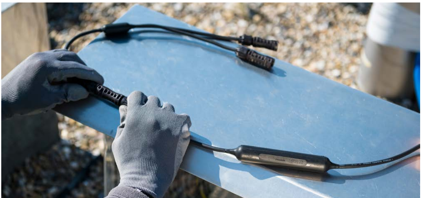
Stäubli offers complete and high quality eBOS products. For example, the MC4-Evo 2 Y-Splitter combined with the MC4-Evo 2 In-line Fuse 3 provide tailor-made cable harness assembly

AV: Let's take a closer look at utility-scale solar plants, which typically cover hundreds