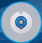
MS-80SH w. Integrated dome heating