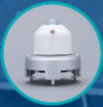
MS-80S w. MV-01

Experiment location: EKO Ami Solar Park, Ibaraki Prefecture, Japan