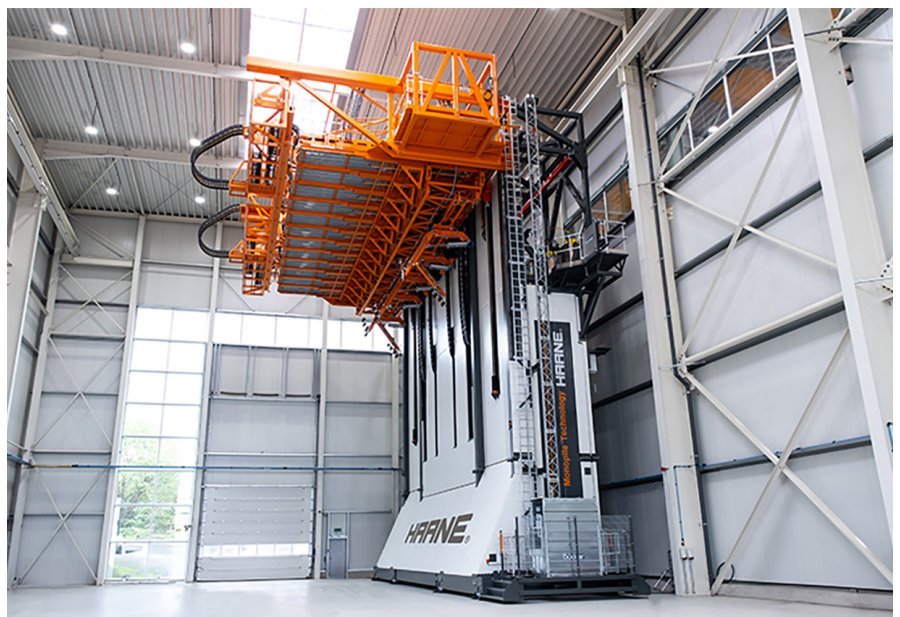
Portal with four welding heads