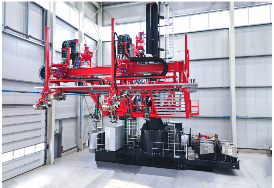
Portal with two welding heads

This marks a significant milestone in automating the production of wind foundation