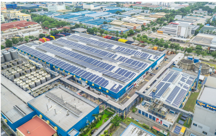
Asia Pacific Breweries, Singapore