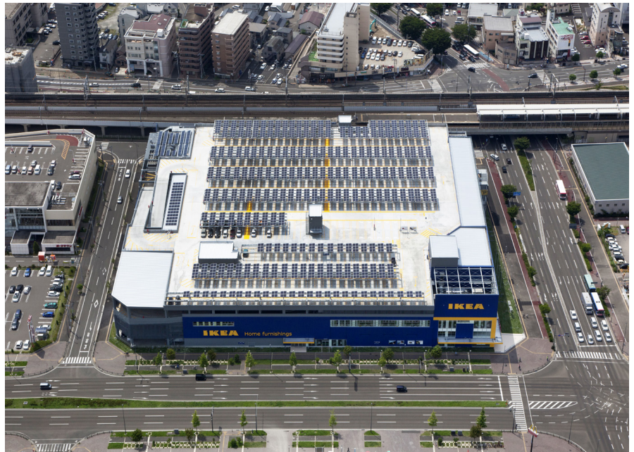
IKEA Sendai, Japan

Sustainability and ethical manufacturing are further plus points: REC is known for its commitment to sustainable practices and has been recently rated with the EcoVadis Silver Medal. By choosing the REC Alpha Pro M panel, customers can be confident that they are investing in products of a company that prioritizes both performance and sustainability.