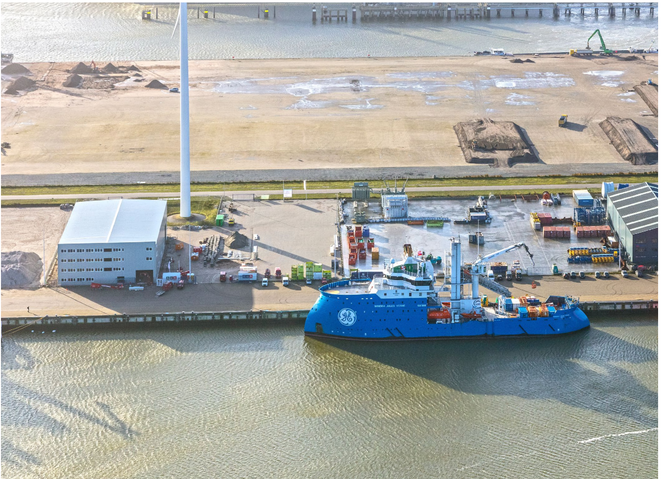
CPS Eemshaven Facility