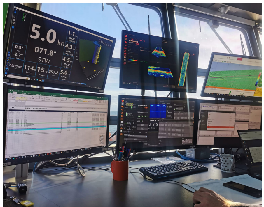
The Nortek VM Operations provides real-time oceanographic data, as seen here in the monitor top left, to the bridge and survey rooms, where it is most needed offshore

The SeaKite has been developed for wide-area site investigation and anomaly mapping using advanced acoustic technology to provide a real-time 3D image of the sub-seabed. It can survey 5 m strips of territory at a time and penetrate up to 8 m below the seabed to identify anything from magnetic pUXO to other non-ferrous geohazards at a 10 cm resolution. It can operate in water depths from 7 to 250 m and work at speeds of up to four knots, six times quicker than comparable ROV surveys, operating on autopilot to control its flight position and height, based on data transmitted from the survey system.