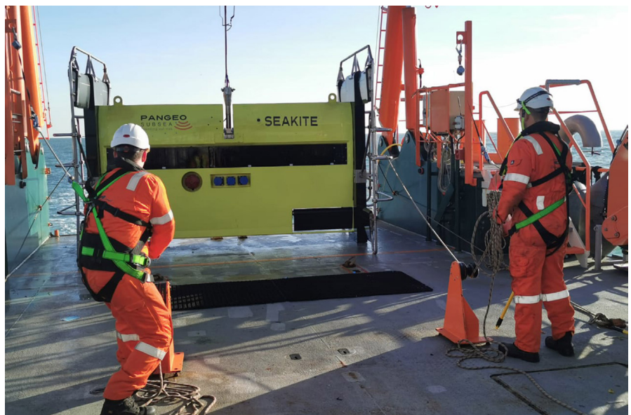
The Kraken Robotics SeaKite Sub-Bottom Imager was towed behind the Geo Ranger to perform the sub-seabed survey

'In this case, the survey requires the precise sailing of a grid,' explains Huitema.