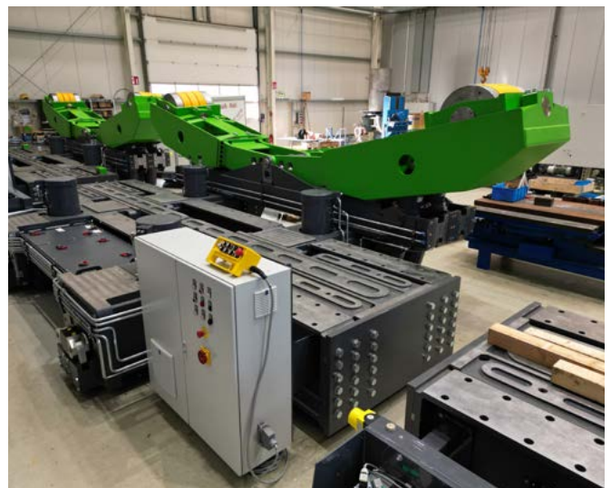
Build 500 ton carriage with 500 ton lifting capacity for HAIZEA Bilbao SL in Spain