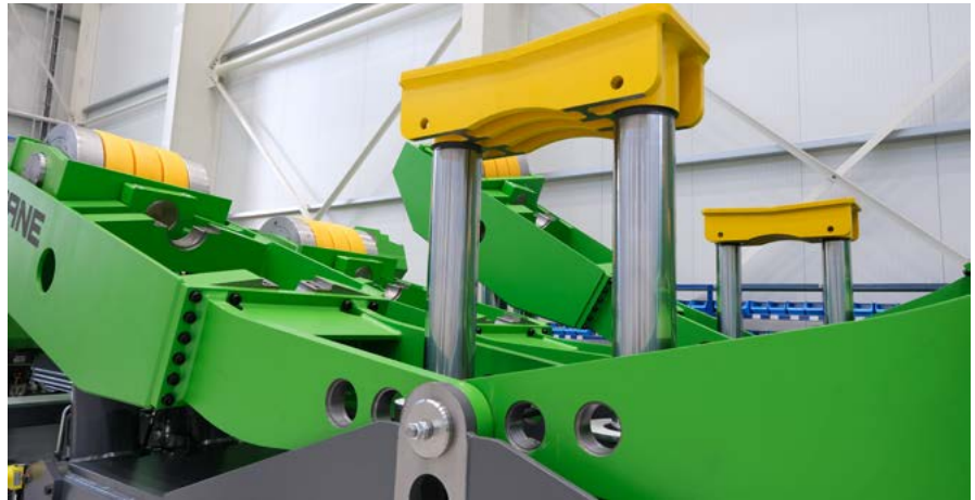
Roller bed equipped with Fit-Up leveler for HAIIEA Bilbao SL in Spain

As well as the significant welding technology that HAANE provides for monopile and