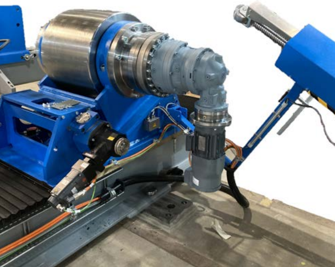
Anti Drift unit