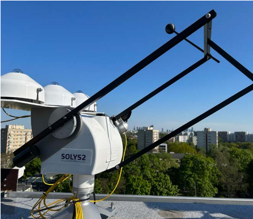
Kipp & Zonen ventilation units can be easily mounted on pyranometers, pyrgeometers, and UV radiometers. This image shows a Kipp & Zonen SOLYS2 sun tracker being installed at the Polish Meteorological and Hydrological Office in Warsaw

technology that melts snow and evaporates dew on the glass dome.