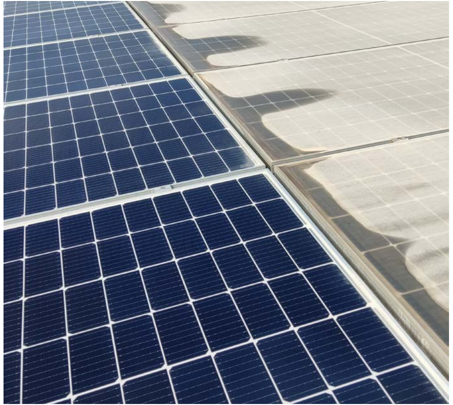
Before and After CRA

Chemitek Solar's coatings work by creating either an antistatic or hydrophobic layer,