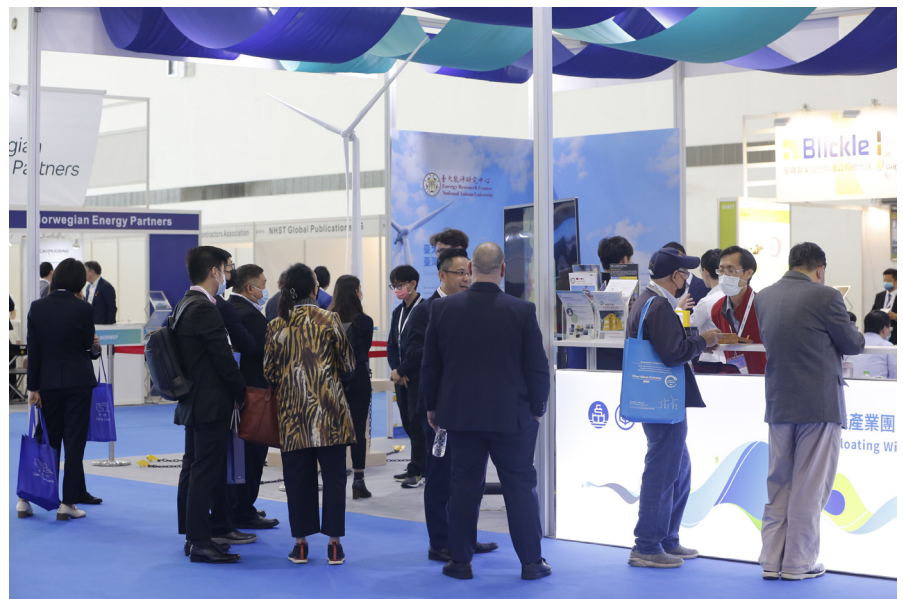
Taiwan's floating pavilion was busy

There is talk of problems in the Taiwan market, for a number of reasons: feed-in-tariffs have gone to zero, localization requirements are too high, the cost of Taiwanese components are too high, and quality is not high enough, and so on. Certainly, this is a young, developing industry and there are teething problems. And yes, they need to be addressed and corrected, but the interest in the market could be felt pulsating in the hall throughout the event.