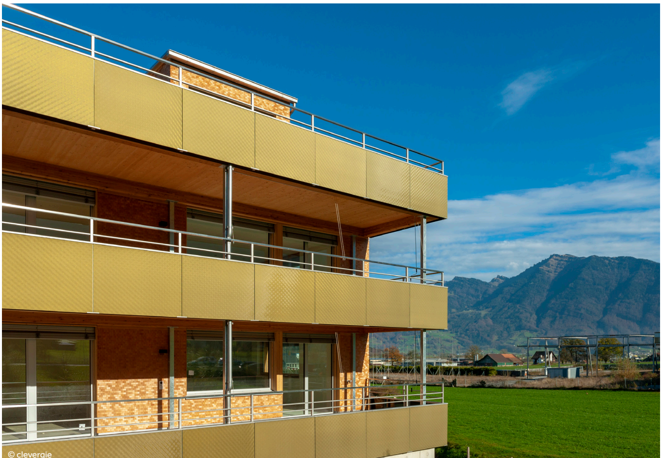
Installation by Ertex Solar in Switzerland at Reichenburg

PES: Do you see any specific colors being favored by the BIPV market?