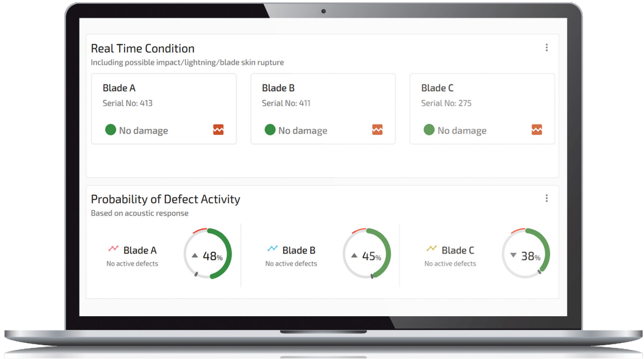
NDE 4.0 technologies like Sensoria™ collect real-time integrity data and report it through an online, easily-accessible data portal, enabling wind turbine operators to proactively plan their inspection and maintenance activities based on the actual conditions of their assets

consists of three Micro Electro-Mechanical System (MEMS) AE sensors, one per blade, a powerful AE data acquisition system (AE-DAQs), and a cloud-based Data-Driven Web Application (DDWA).