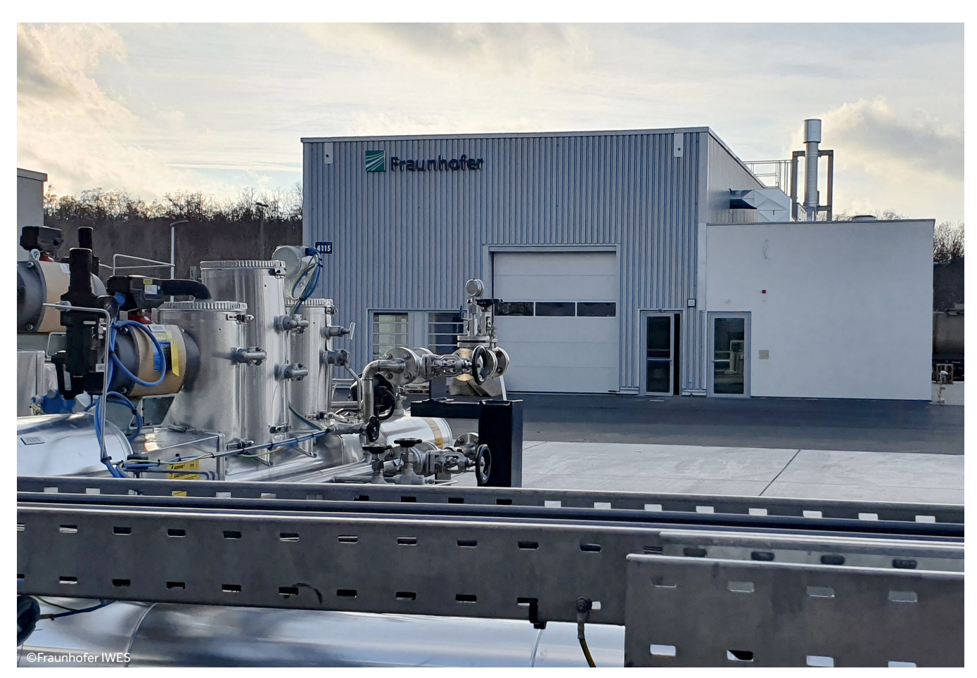
BU: Fraunhofer IWES Hydrogen Lab Leuna: green hydrogen in the chemical industry

However, the decisive aspect for the establishment of a sustainable green hydrogen economy will be the price of producing the hydrogen. This depends on the