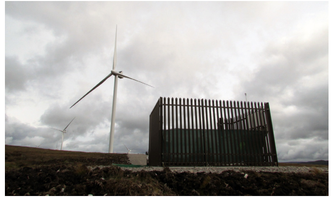
Figure 1: Permanent Wind Lidar installed with SSE

Conversely, the presence of complex flow requires different procedures for handling RSD data to make it representative of that which would have been measured by a cup anemometer, as discussed above.