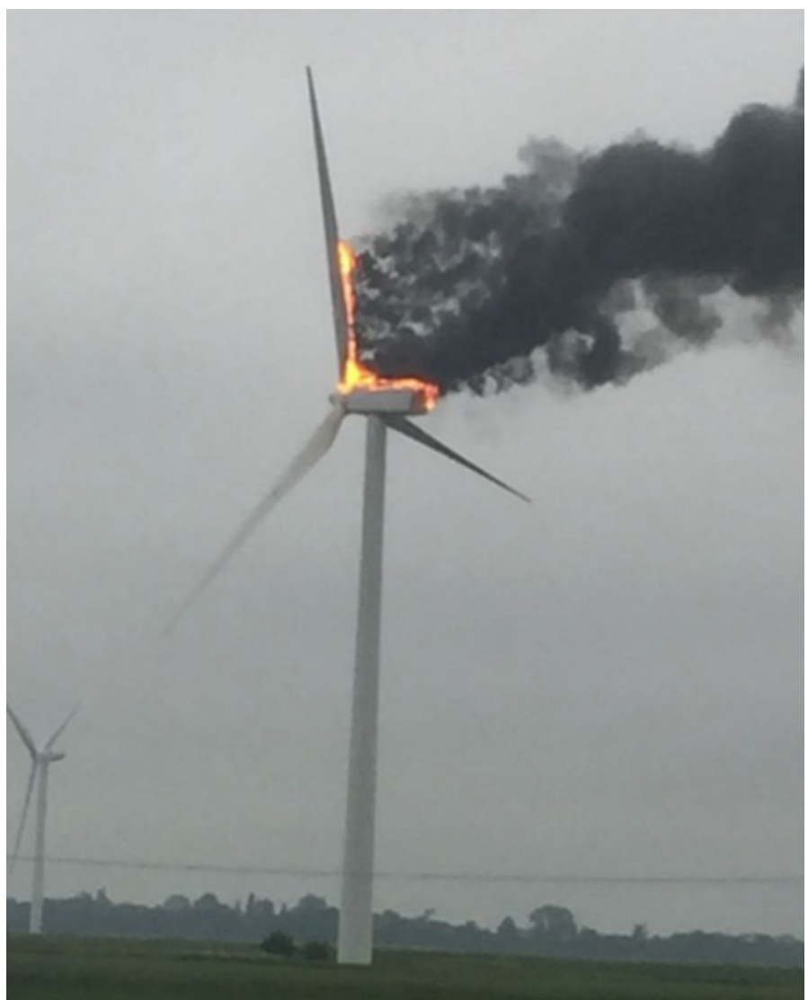
Figure 3: A recent wind turbine failure due to a lightning strike in Crowell TX.

https://www.vaisala.com/sites/default/files/documents/WEA-MET-2021-Annual-Lightning-Report-B212465EN-A.pdf