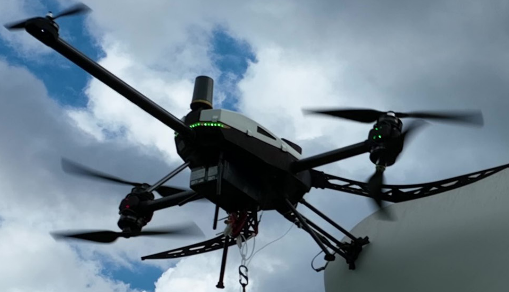
An LPS inspection using the Voliro T drone and micro-ohmmeter payload