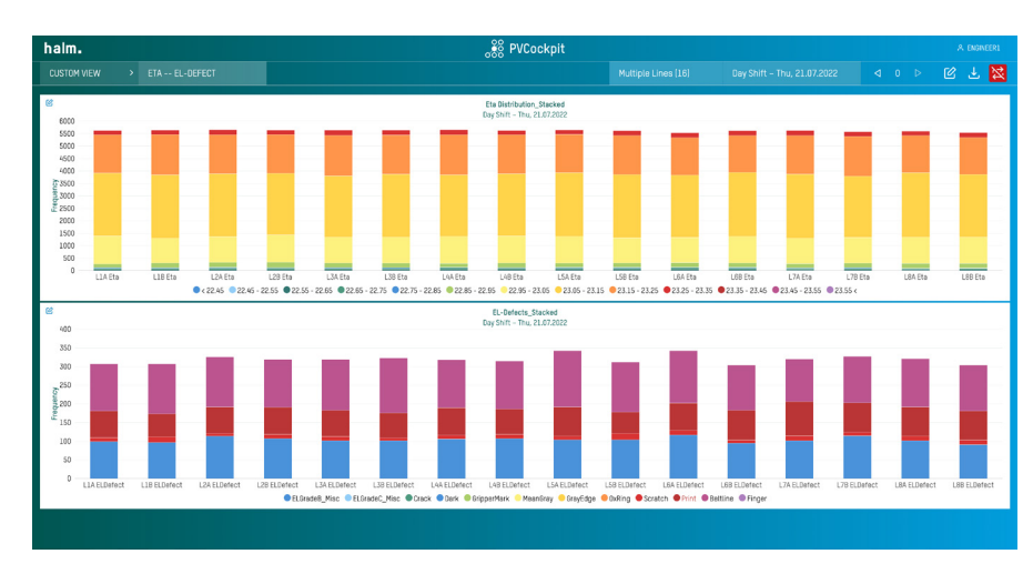
Figure 1: The top diagram shows the assigned EL quality classes of 16 lines. The lower diagram shows in detail which defects occurred in all B-quality cells

manufacturers to improve their quality and process control.