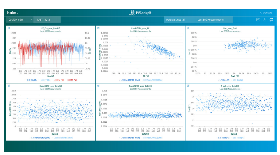
Figure 2: Compilation of different measurements for several lines