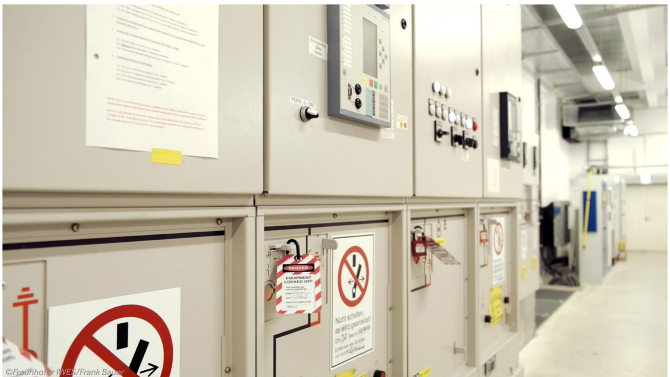
40 kV medium-voltage switchgear units

The course of the voltages coincides to within a few per cent in the pre-fault case, with the series impedance switched on, and in the fault case. The standard-conforming evaluation shows that the results are within the tolerance bands even when considering the dynamic behavior. Furthermore,