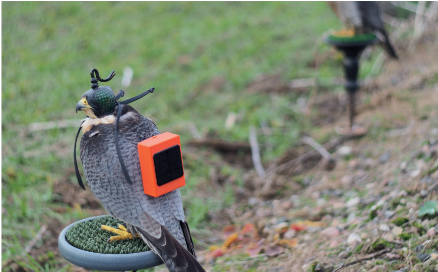
A bird equipped with GPS during efficiency test on a wind farm in Poland