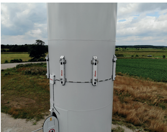
New version of Bird Protection System: BPS Long-range