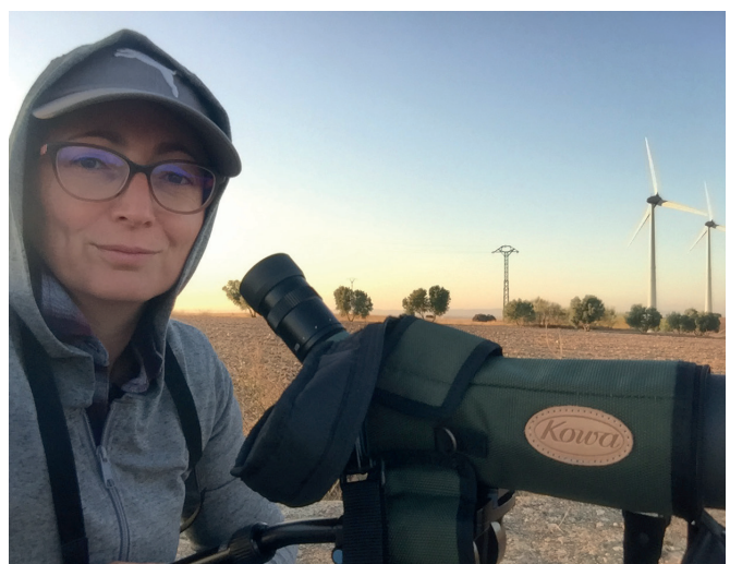
Ornithological observations during verification BPS operation on a wind farm in Spain