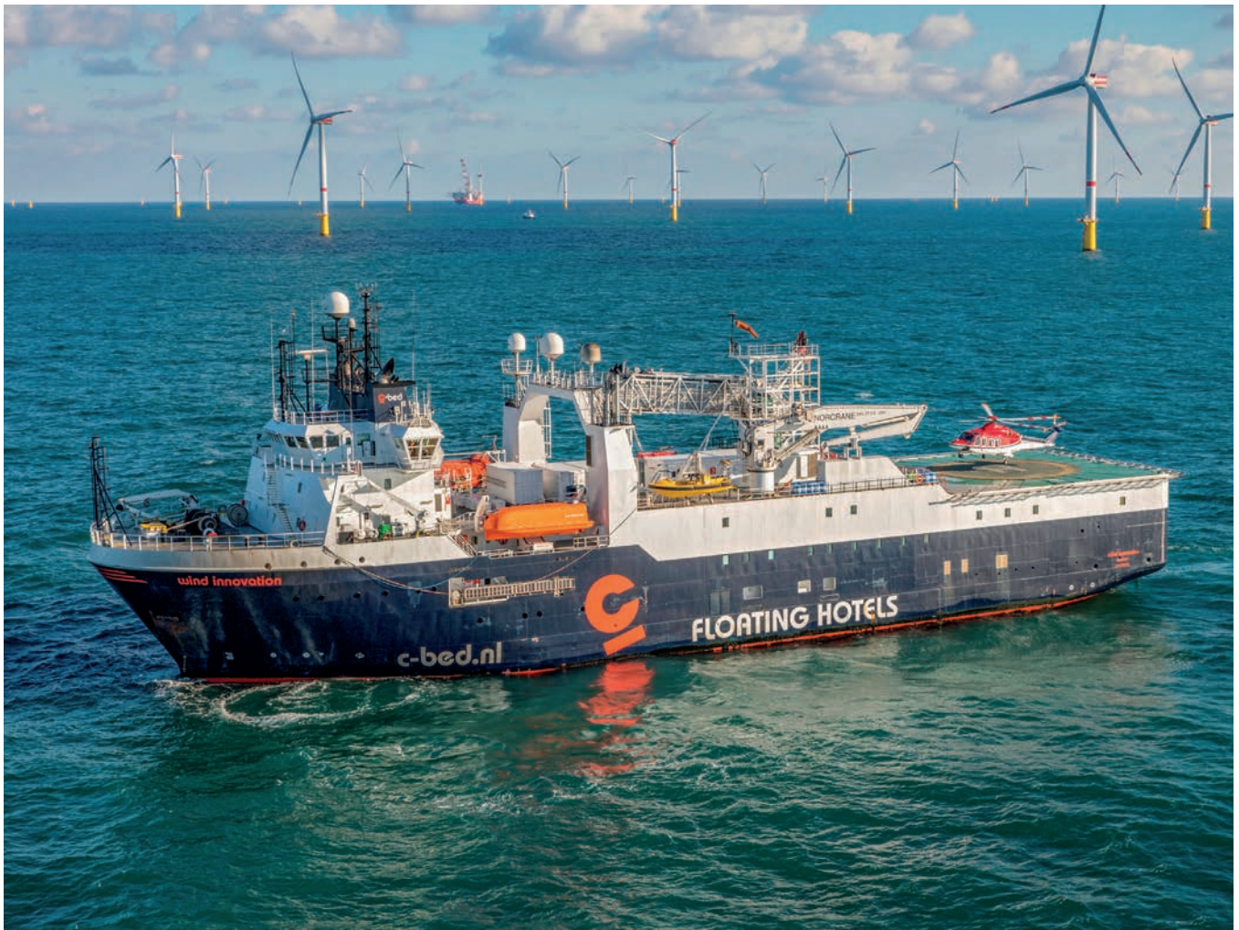
Wind Innovation Heli crew-x

services on time, within budget and at competitive cost that fully meet the applicable requirements. Maintenance and improvement of the DHSS Management System, which is designed to the standards and principles for Quality Management, Health & Safety Management, and Environmental Management is a continuous process.