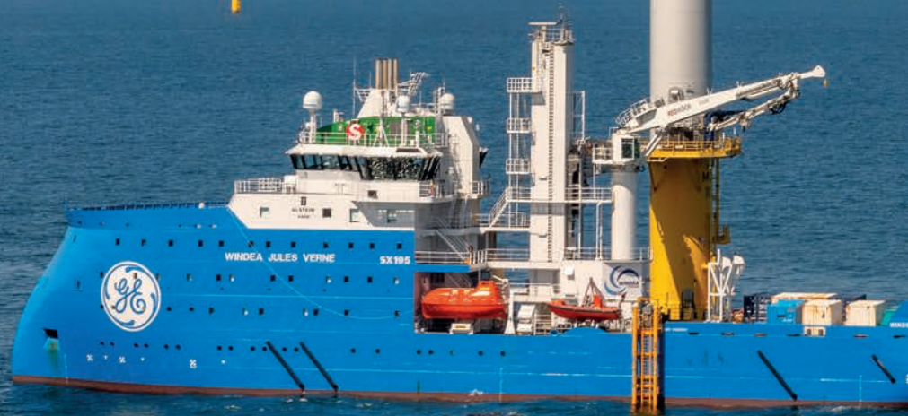
Windea Jules Verne at OWF Merkur