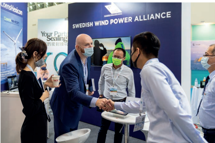
Sweden had the largest pavilion at the show

Again, exhibitors were extremely happy with