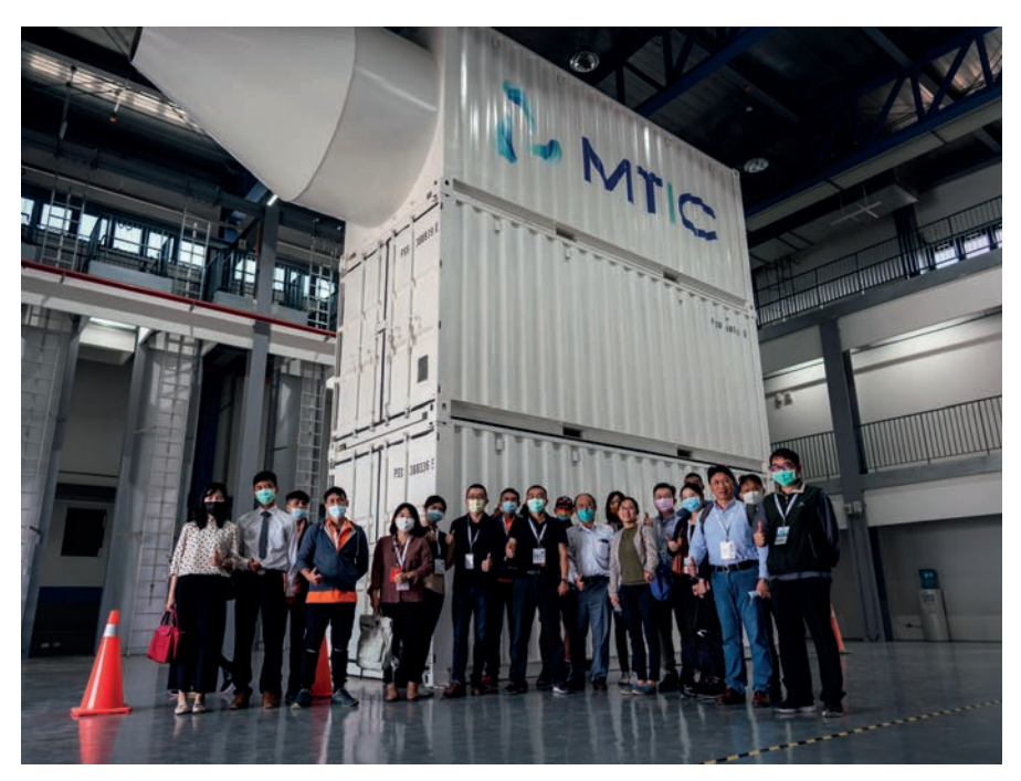
Site tour to MIRDC's new facility

WEA again had a vessel in the harbor next to the venue. This allowed visitors to get a true feel for the industry, with a first-hand view of the large salvage working vessel from Asian Marine Salvage based in Kaohsiung.