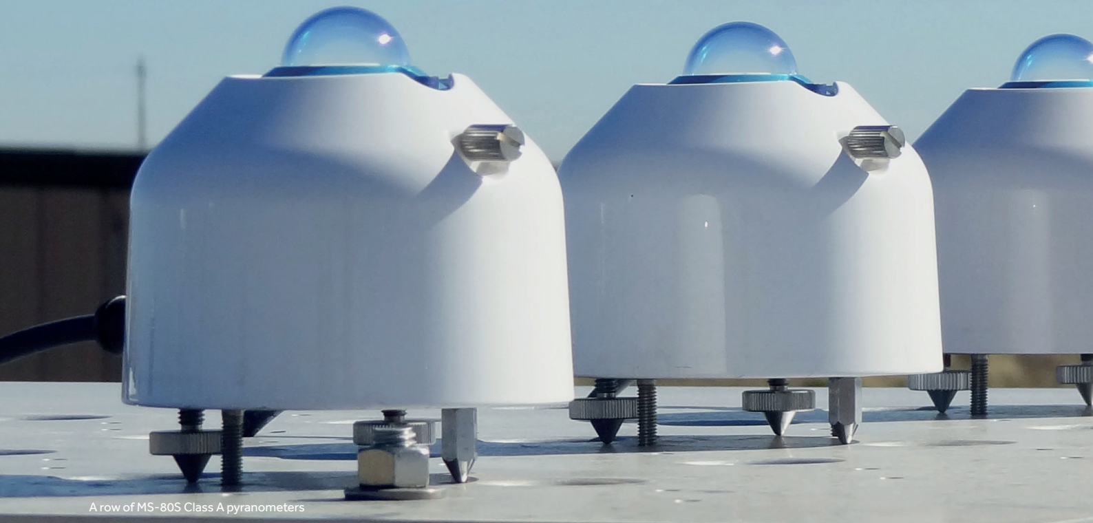
A row of MS-80S Class A pyranometers