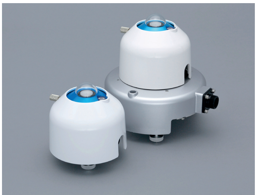
MS-80S Class A pyranometer & MS-80S with MV-01 All-Weather Heater & Ventilator

PES: Other pyranometers require a separate data-logger to access their data