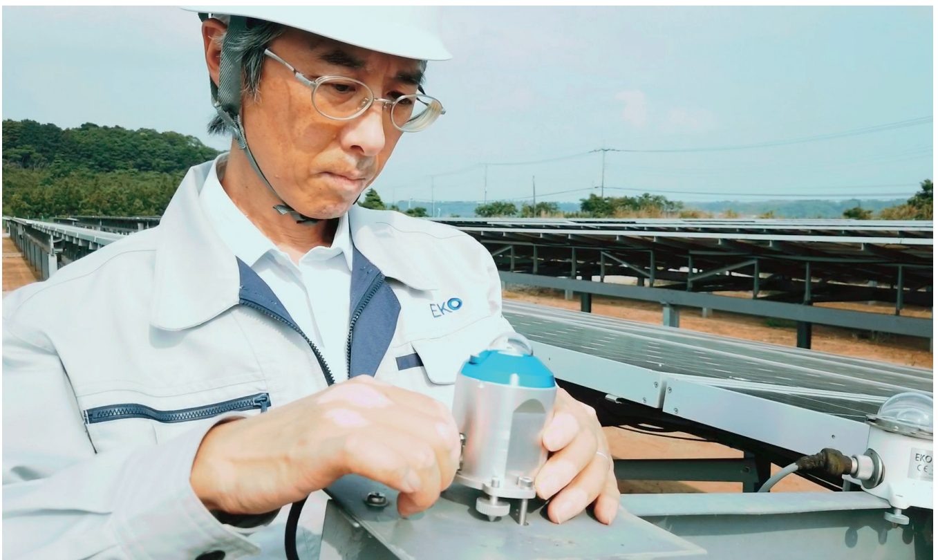
An EKO engineer installing a new MS-80S pyranometer at the EKO Inashiki solar park in Japan

We designed the MS-80S to be easy to use, and install, and to integrate with any DAQ system; to help make upgrading as smooth as possible.