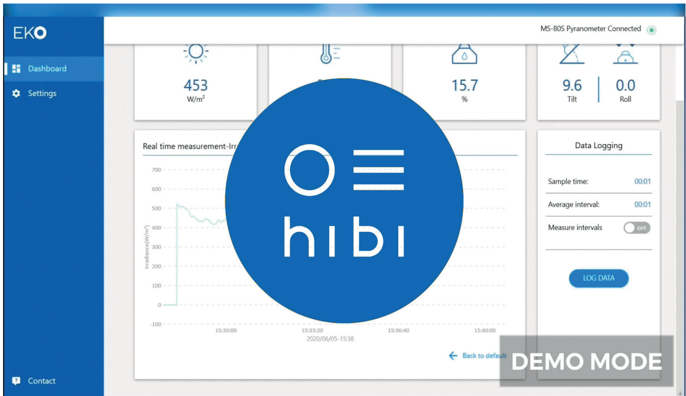
Hibi software, demo screen

For the typical application of POA, GHI or BOA irradiance measurement mounts are available, along with standard interconnecting cables for building a pyranometer network.