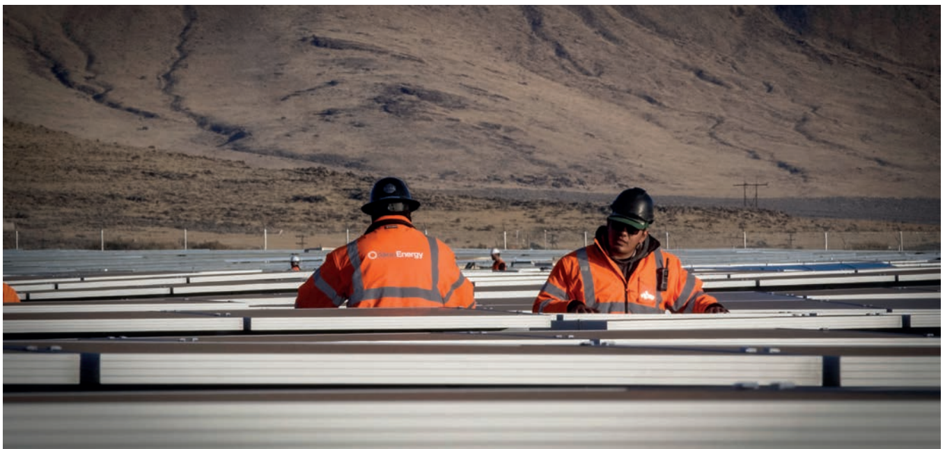
Bifacial Reflective Foundation Reduces Overhead Lift Demands