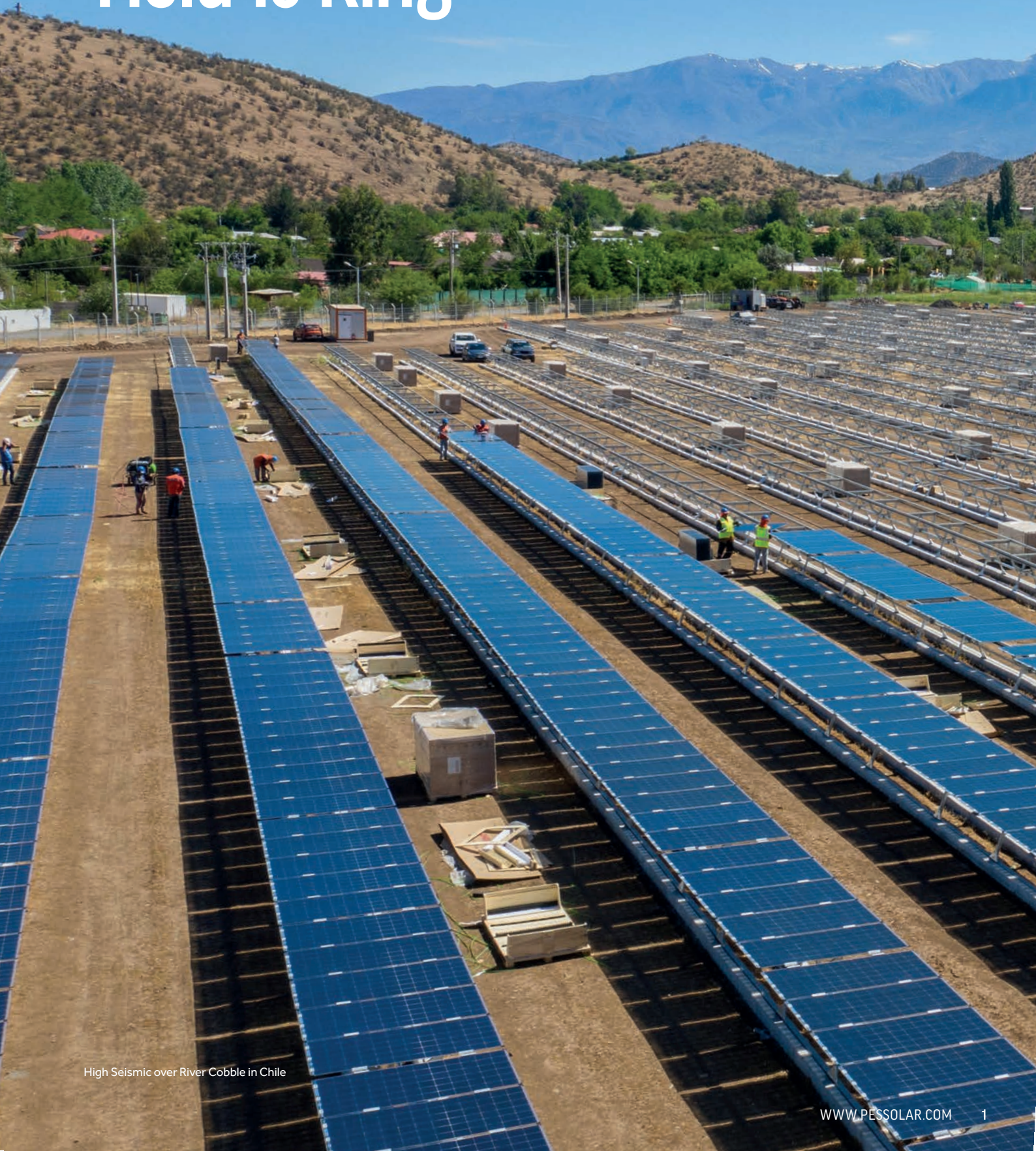
High Seismic over River Cobble in Chile