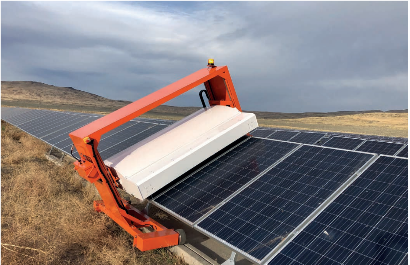
Spot dry and wet robot

insurance tool to know you will meet your debt service coverage ratio on a low priced PPA. Low PPA prices equate to a lower tolerance for energy losses. Affordably increasing cleaning frequency minimizes these losses.