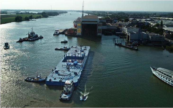
The barge was launched at the Neptune Marine shipyard in Hardinxveld in the Netherlands and has been designed with integrated cable carousel to offer NKT the opportunity to carry several thousand tonnes of cables.