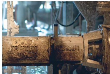
Easy deployment to existing or new machinery. Fully wireless, no need for wiring.