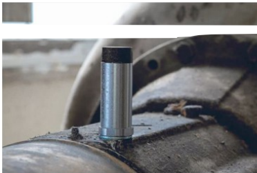
Cost-efficient way to capture vibration and temperature data continuously for predictive maintenance.