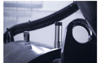
Industrial node designed for demanding industrial conditions.