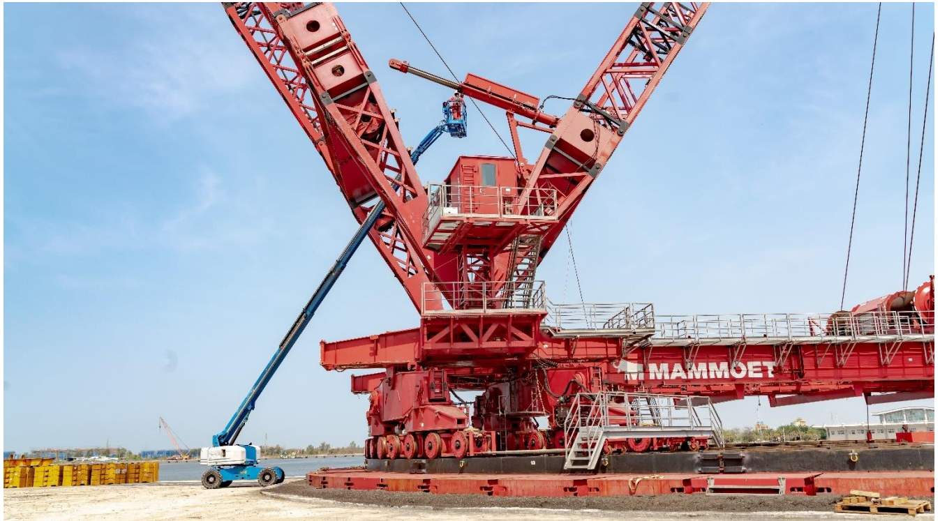
PTC200-DS Ring Crane during final assembly stage at Sing Da Port.