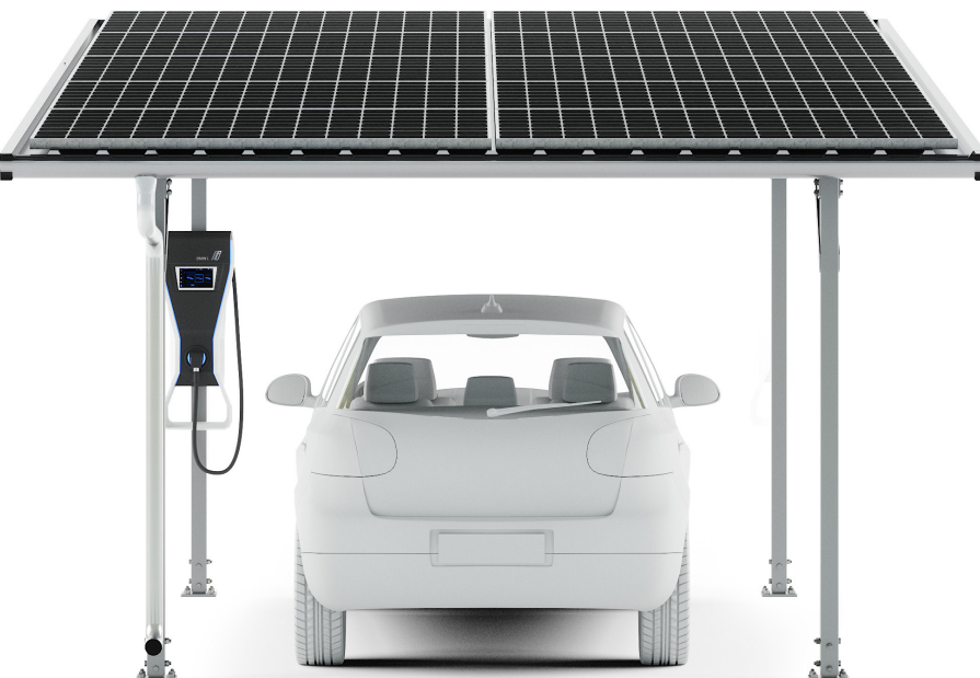
Single charging station

MS: Our strongest market is Germany, and we have an established presence in almost all the EU countries. Our sales strategy is transparent and loyal. Therefore, we limit our partnerships in each country to just a handful of wholesalers, supporting them with marketing, product trainings and handing over leads.