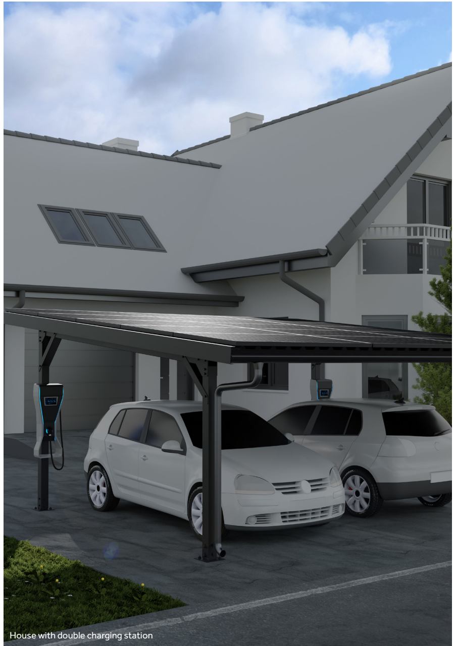
House with double charging station

Now, finally the market is attractive to investors again, and due to the increasing pressure from the European Union to increase renewable shares in the grid, the market is recovering. This year we exhibited at the Genera fair in Madrid and was overwhelmed with the success. We really look forward to seeing the development the