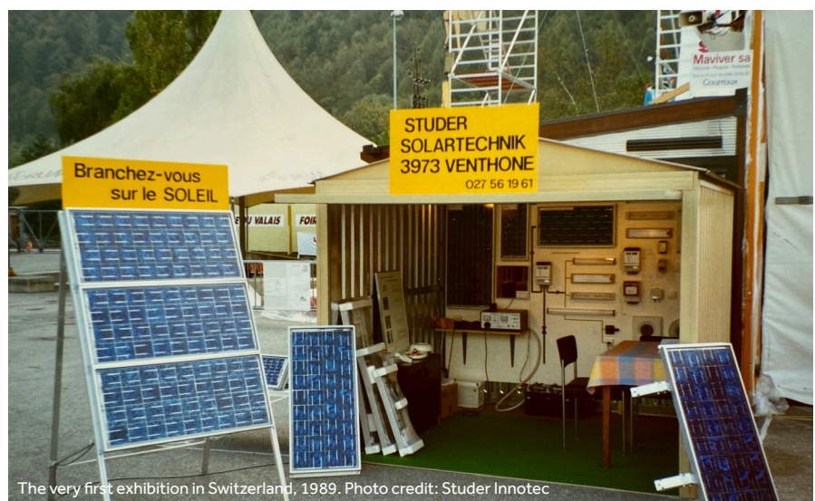
The very first exhibition in Switzerland, 1989.

During the 90's, Studer grew exponentially and developed its first sine wave inverter.