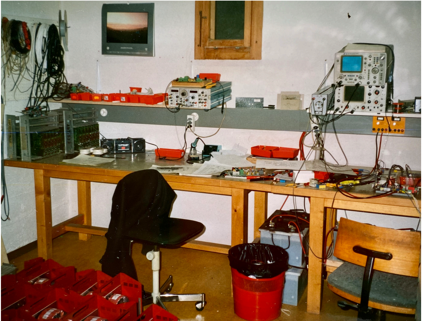
Studer lab: The laboratory where Roland Studer manufactured its first device.