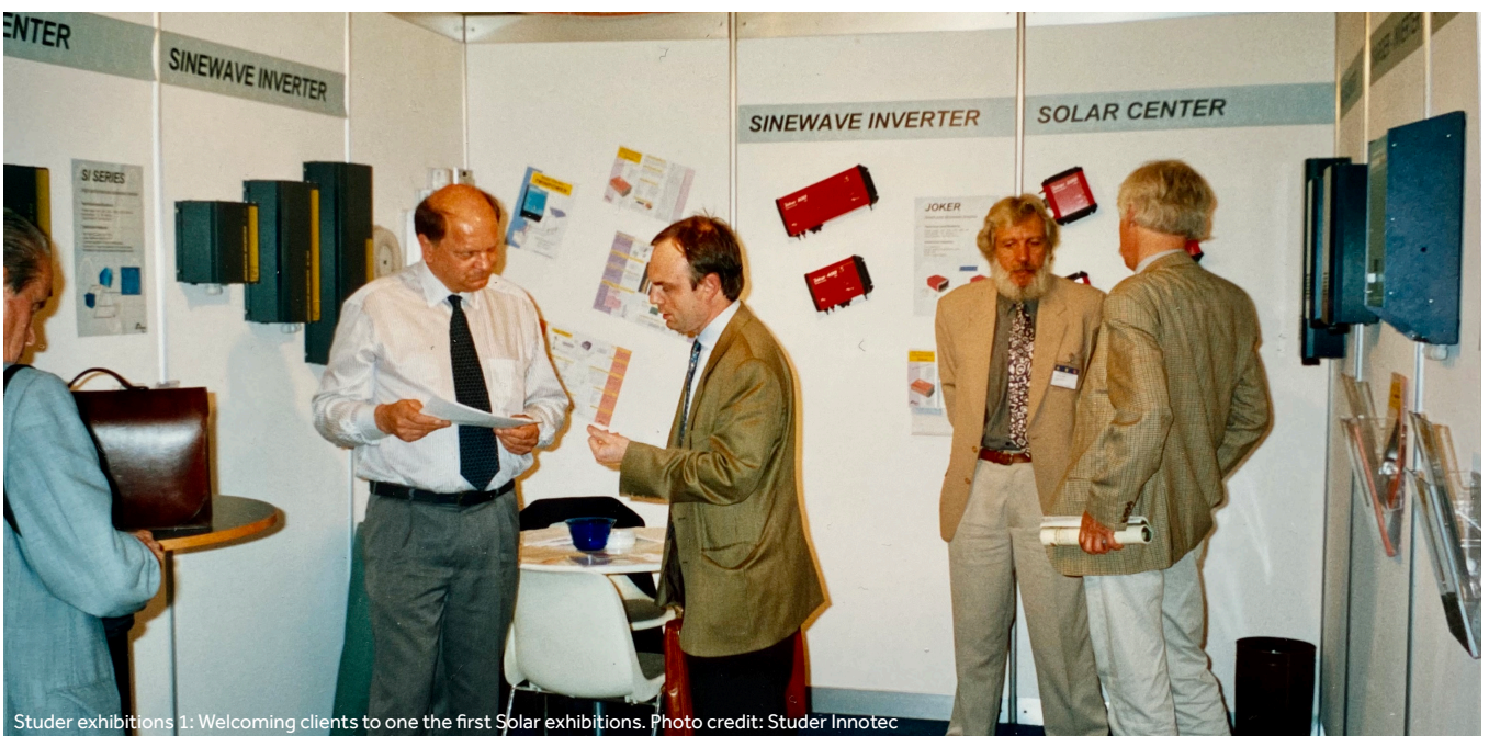
Studer exhibitions 1: Welcoming clients to one the first Solar exhibitions.

However, our philosophy has always been the same, and that's why the common point between all our clients is loyalty. We have been working with many of them for over 20 years.