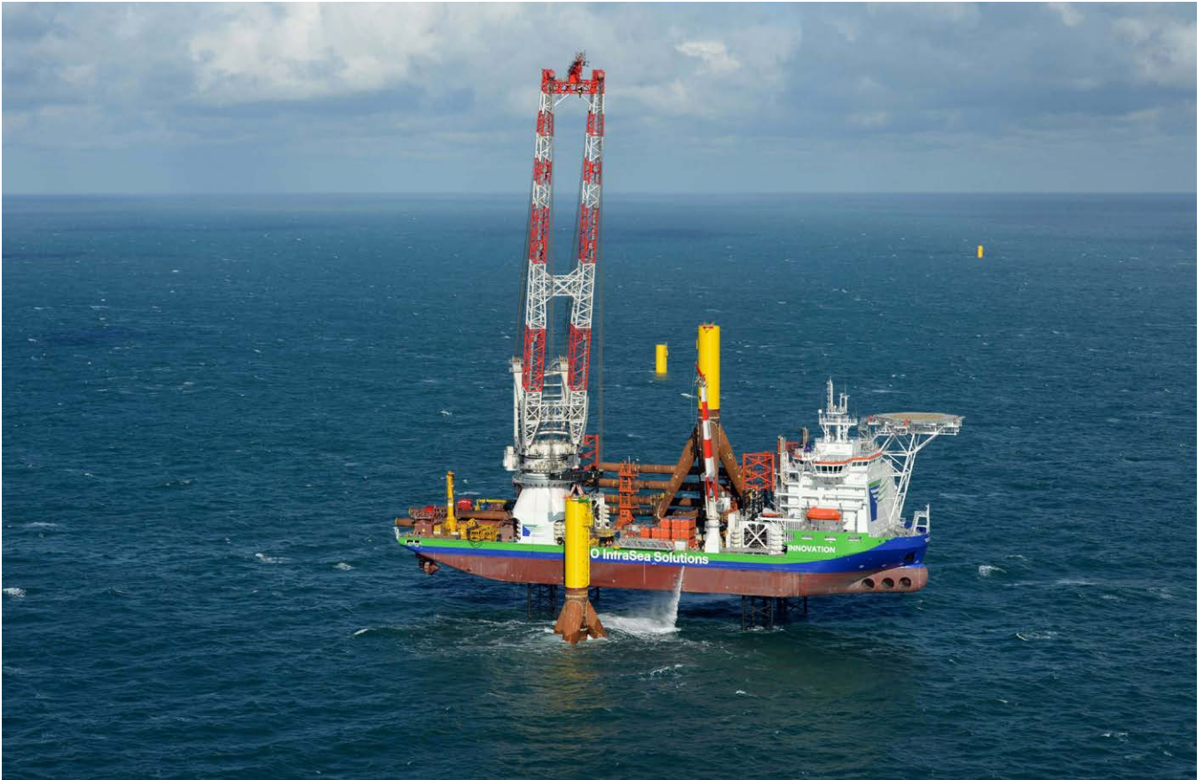
OEG Offshore provided a range of cargo carrying units for the Global Tech 1 wind farm project in the German North Sea