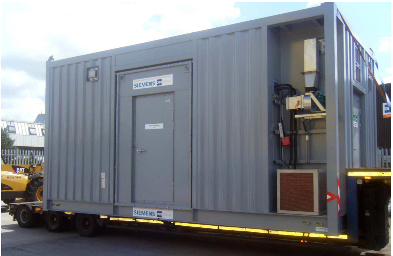
OEG Offshore's custom-built Local Equipment Room (LER) modules for the London Array Offshore Wind Farm

During a typical contract for a wind farm development, an experienced technician can complete a range of services in one trip from surface helideck friction testing, helifuel compliance audits and certification, all compliant to UK CAA CAP 437, along with helicopter refuelling training and