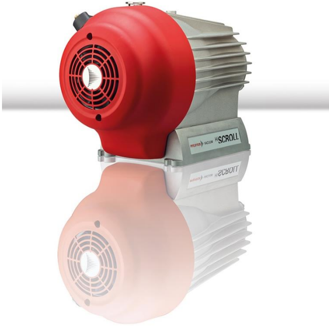
Caption: Pfeiffer Vacuum scroll pumps from the HiScroll range