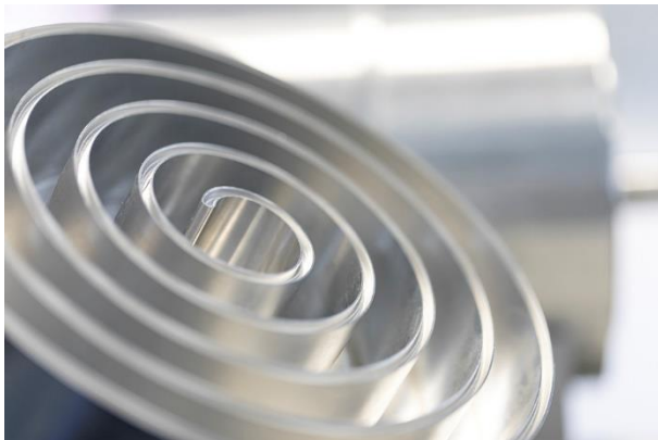
Caption: Spiral used in HiScroll pump system