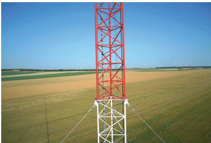
SupAirVision's tools are also perfectly calibrated to inspect measuring masts

50% of French wind turbines are in the north-east of the country, so I became interested in wind turbines. However, the capacities of the machines at the time did not allow us to provide an adequate service for wind turbine operators.'