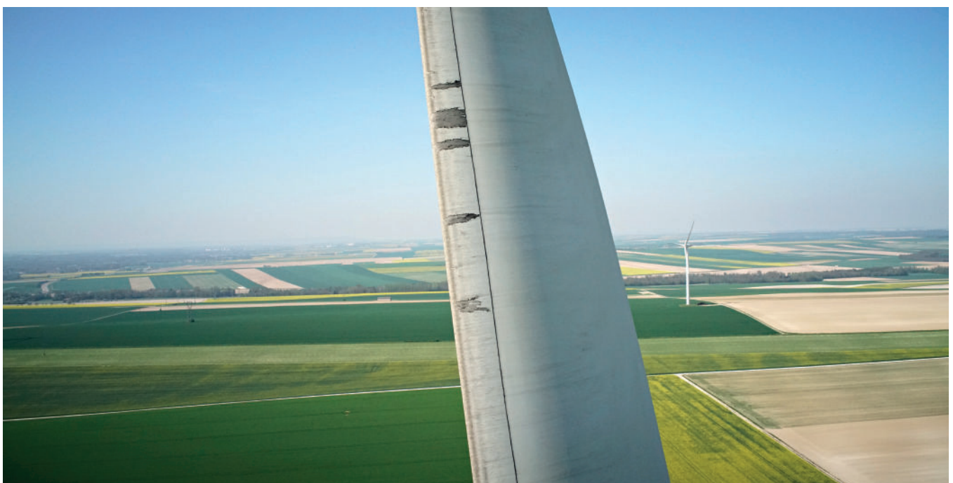
HD photo inspection: a SupAirVision specialty to detect the smallest defects and ensure precision while tracking wind turbine blades

2010: 'I was one of the pioneers of the drone in France,' explains the director. 'In 2013, I was the first UAV pilot approved in Champagne with AltusPhotos. Right from the start, I felt that this machine would do a lot more than just landscape photos! We are at the heart of the French wind energy field,