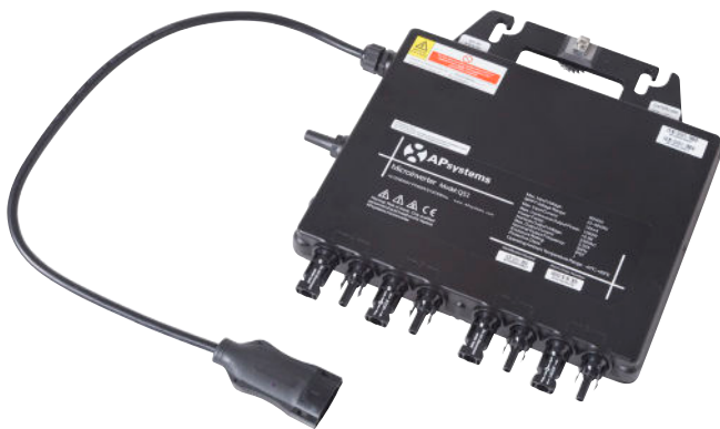
QS1 HD with AC cable