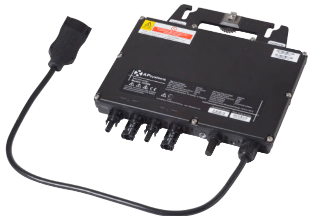
YC600 HD with AC cable

We are one of the only microinverter companies worldwide which has its Reactive Power Control (RPC) microinverter range ready, which means compliant to be installed almost everywhere in Europe including in Germany, but also in Australia, or California for example.