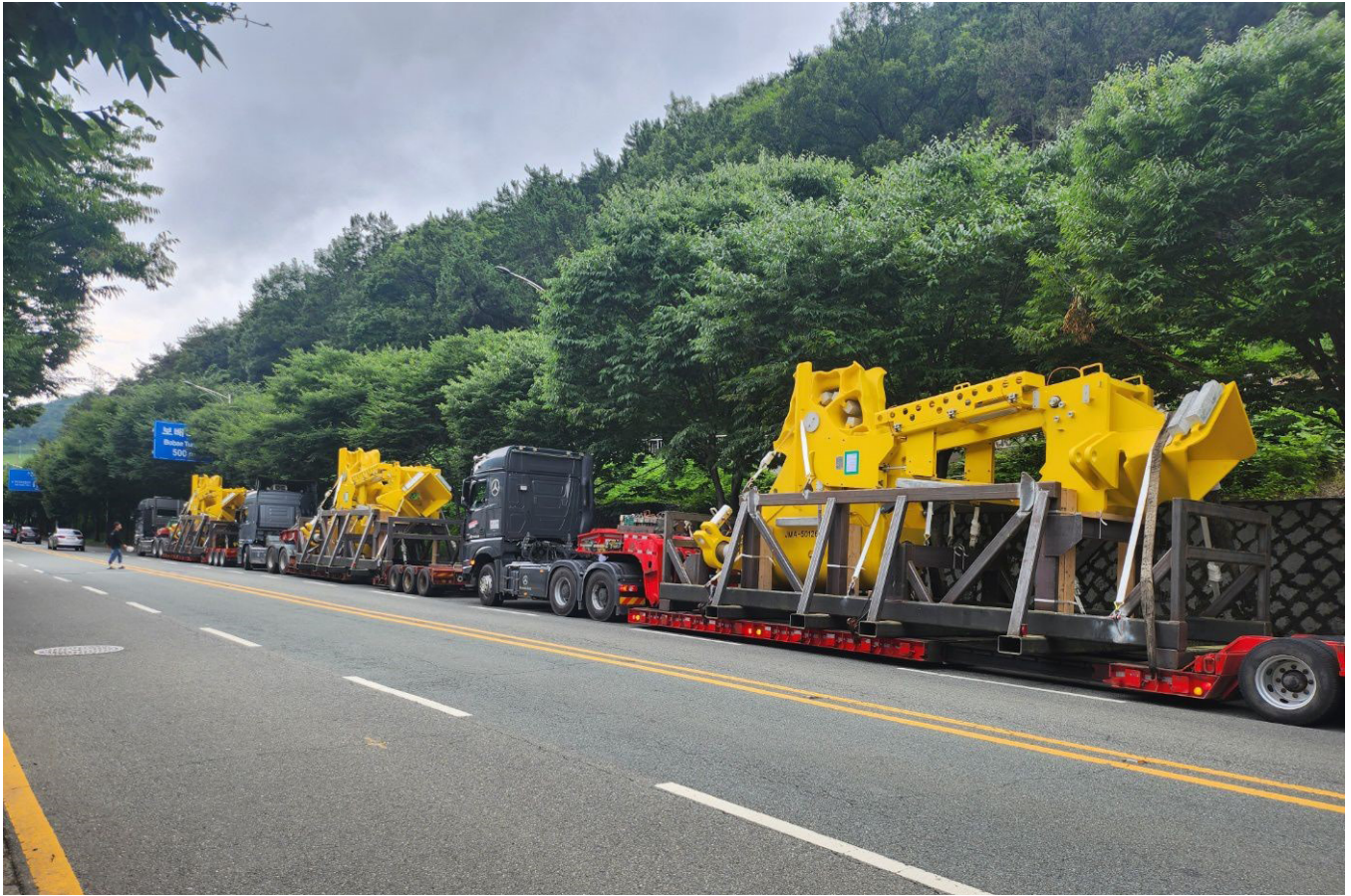
The UK facility will build upon Bardex's decades of experience building all of the equipment it designs. Advances in the BarLatch® design will mean approximately a 30% reduction in weight for future projects, but the cumulative need of six pieces per turbine in a development field adds up

maintenance trip, resulting in delays to wind turbine maintenance schedules, increasing risks for the operator. So, what better place to set up a vessel maintenance facility than the same place where the turbine assembly infrastructure was installed?